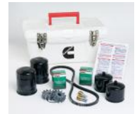
Cummins Onan Cruise Kit