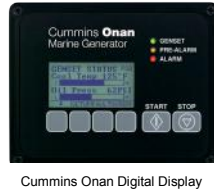
Cummins Onan Digital Display