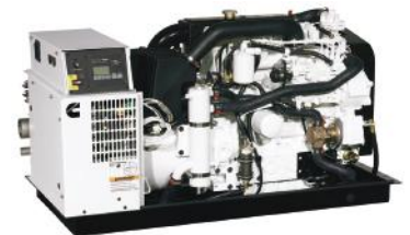
Standard model without sound shield and with Cummins Onan Digital Display shown